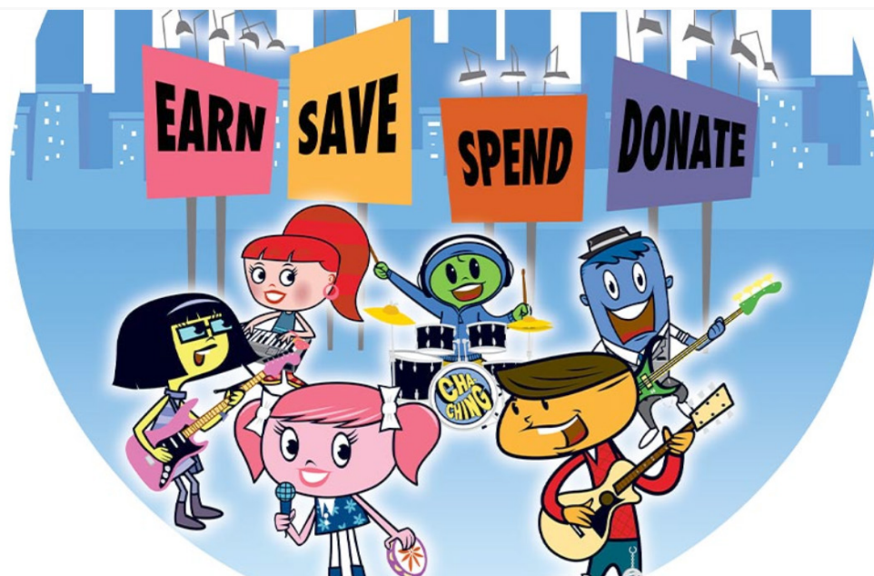
Figure 1. The Cha-Ching band teaches fundamental money management concepts. Adopted from "Cha-Ching financial literacy for children," by Prudential Corporation Asia, 2020. Copyright 2020 by Prudential Corporation Asia. Reprinted with permission.

Before the launch of the program, Prudential conducted